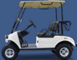
CLASSIC 2 EEC