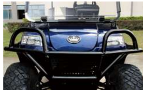
HEAVY DUTY BRUSH GUARD