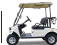
CLASSIC 2 EEC