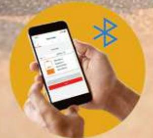
Mobile & PC Live Monitor