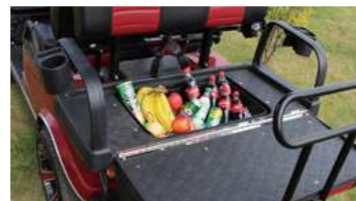
REAR-FACING, FLIP-FLOP SEAT KITS WITH STORAGE COMPARTMENT