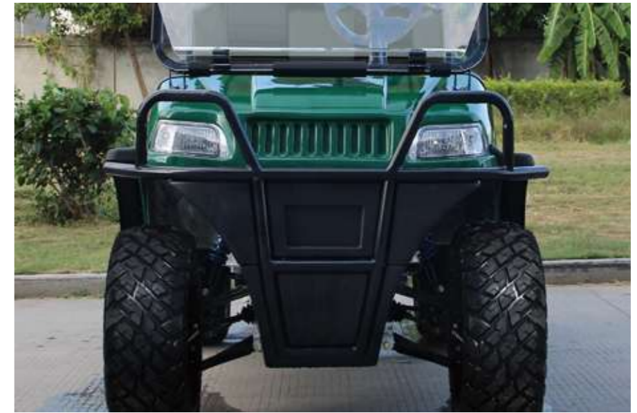
HEAVY DUTY BRUSH GUARD ( TURFMAN 700 ADN 700 EEC )