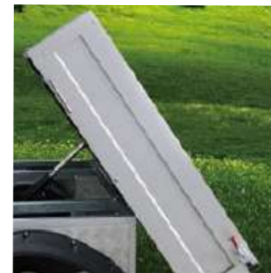
OPTIONAL ELECTRIC TIPPER