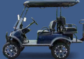
FORESTER 4 PLUS