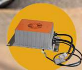
25A Adaptive Charger