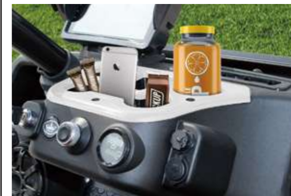
COLOR MATCHED DASHBOARD WITH FOUR CUP HOLDERS/CELL PHONE HOLDER