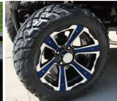
14" ALLOY WHEEL RIMS WITH COLOR MATCHING INSERTS AND SILENT TIRE WITH OFF-ROAD THREAD