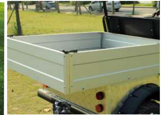
REVERSIBLE ALUMINUM CARGO BOX ( SIZE VARIES BETWEEN MODELS )