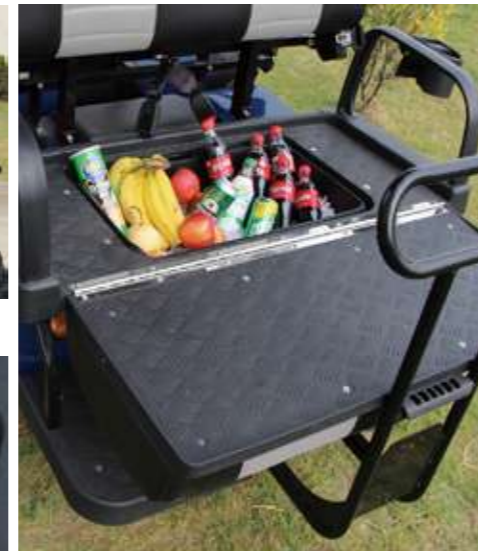
REAR-FACING, FLIP-FLOP SEAT KITS WITH STORAGE COMPARTMENT