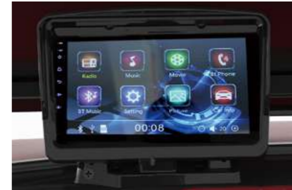
OPTIONAL 9" TOUCH SCREEN (RADIO, MUSIC, SPEEDOMETER, BLUETOOTH, BACK-UP CAMERA, CAR APP CONNECTION)