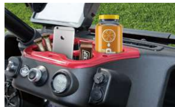
COLOR MATCHED DASHBOARD WITH FOUR CUP HOLDERS/CELL PHONE HOLDER