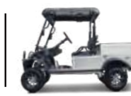
TURFMAN 700 EEC