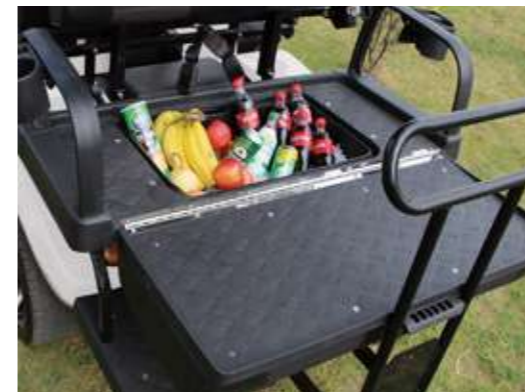
REAR-FACING, FLIP-FLOP SEAT KITS WITH STORAGE COMPARTMENT