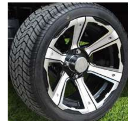
14" ALLOY WHEEL RIMS WITH COLOR MATCHING INSERTS AND RADIAL DOT TIRES