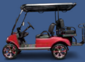
CLASSIC 4 PLUS