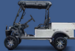
TURFMAN 700 EEC