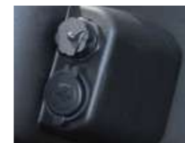
TWO USB CONNECTIONS