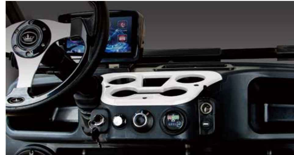
AUTOMOTIVE DESIGNED DASHBOARD, COLOR MATCHED CUP HOLDER INSERT