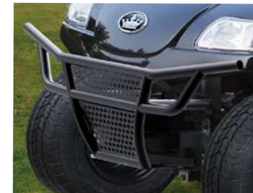
FRONT BRUSH GUARD ( TURFMAN 1000 )