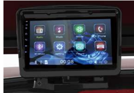
OPTIONAL 9" TOUCH SCREEN (RADIO, MUSIC, SPEEDOMETER, BLUETOOTH, BACK-UP CAMERA, CAR APP CONNECTION)