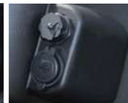
TWO USB CONNECTIONS