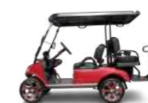
CLASSIC 4 PLUS