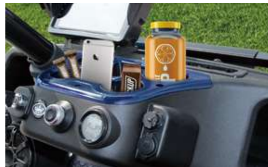
COLOR MATCHED DASHBOARD WITH FOUR CUP HOLDERS/CELL PHONE HOLDER