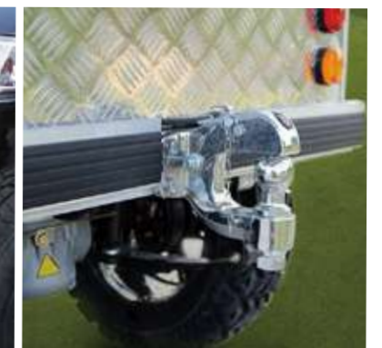
TOWING HOOK ( FOR TURFMAN 700 ADN 1000 )