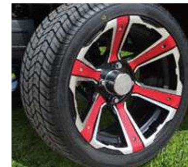
14" ALLOY WHEEL RIMS WITH COLOR MATCHING INSERTS AND RADIAL DOT TIRES